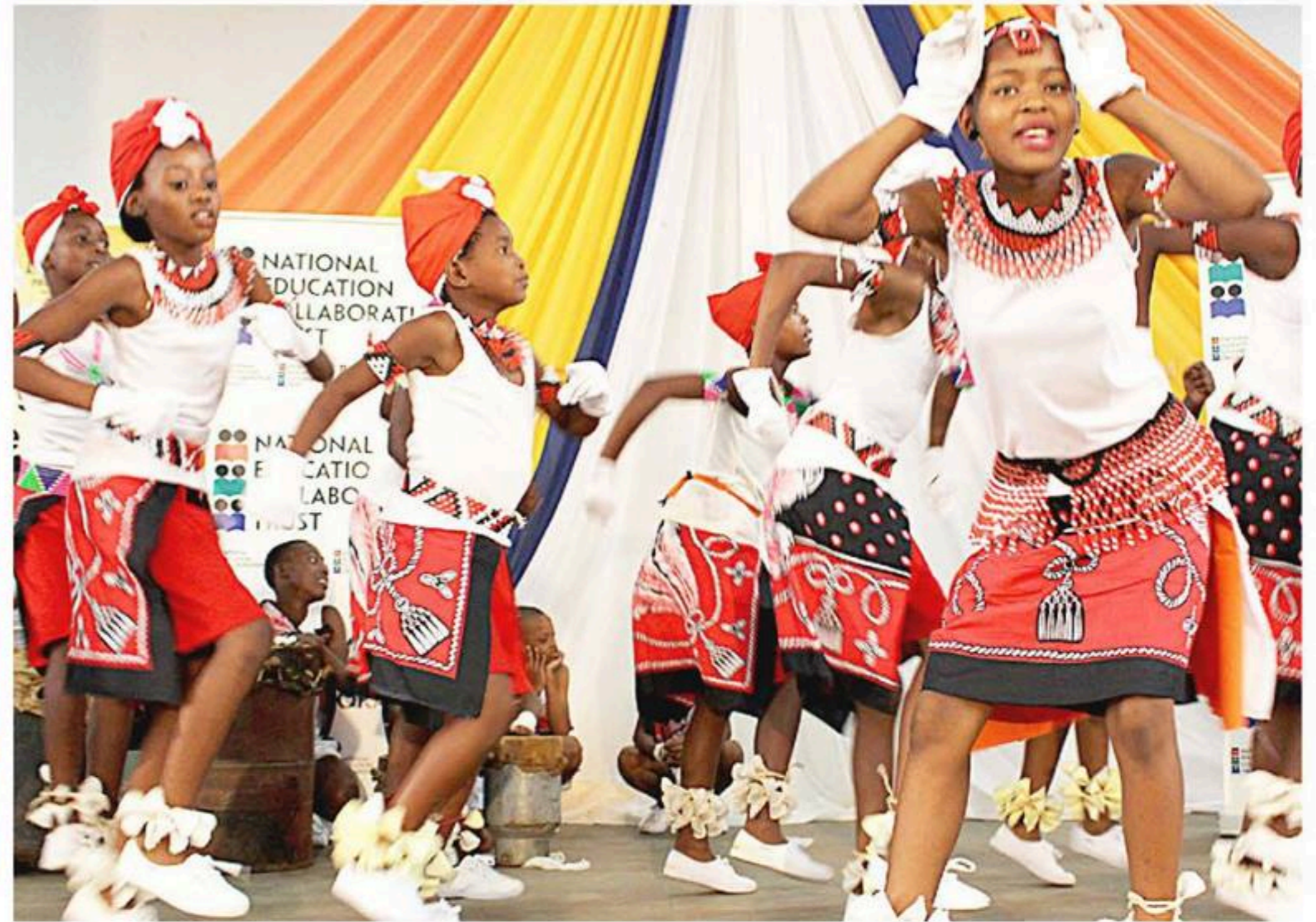
Kgabetli Primary School Dancers