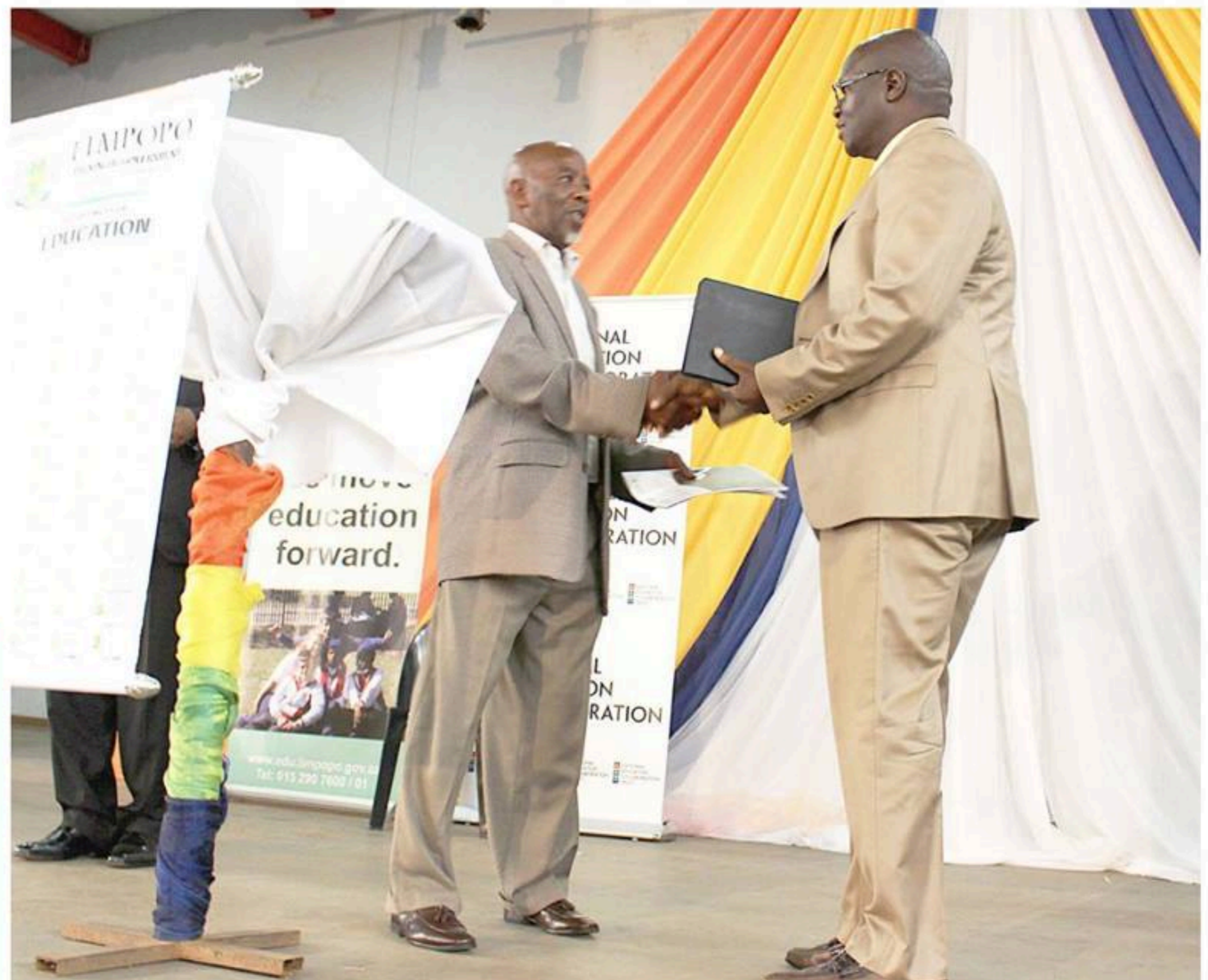
MEC for Education : Hon. Maaria Ishmael Kgetjepe and MMC Thlalefi Mashamaite