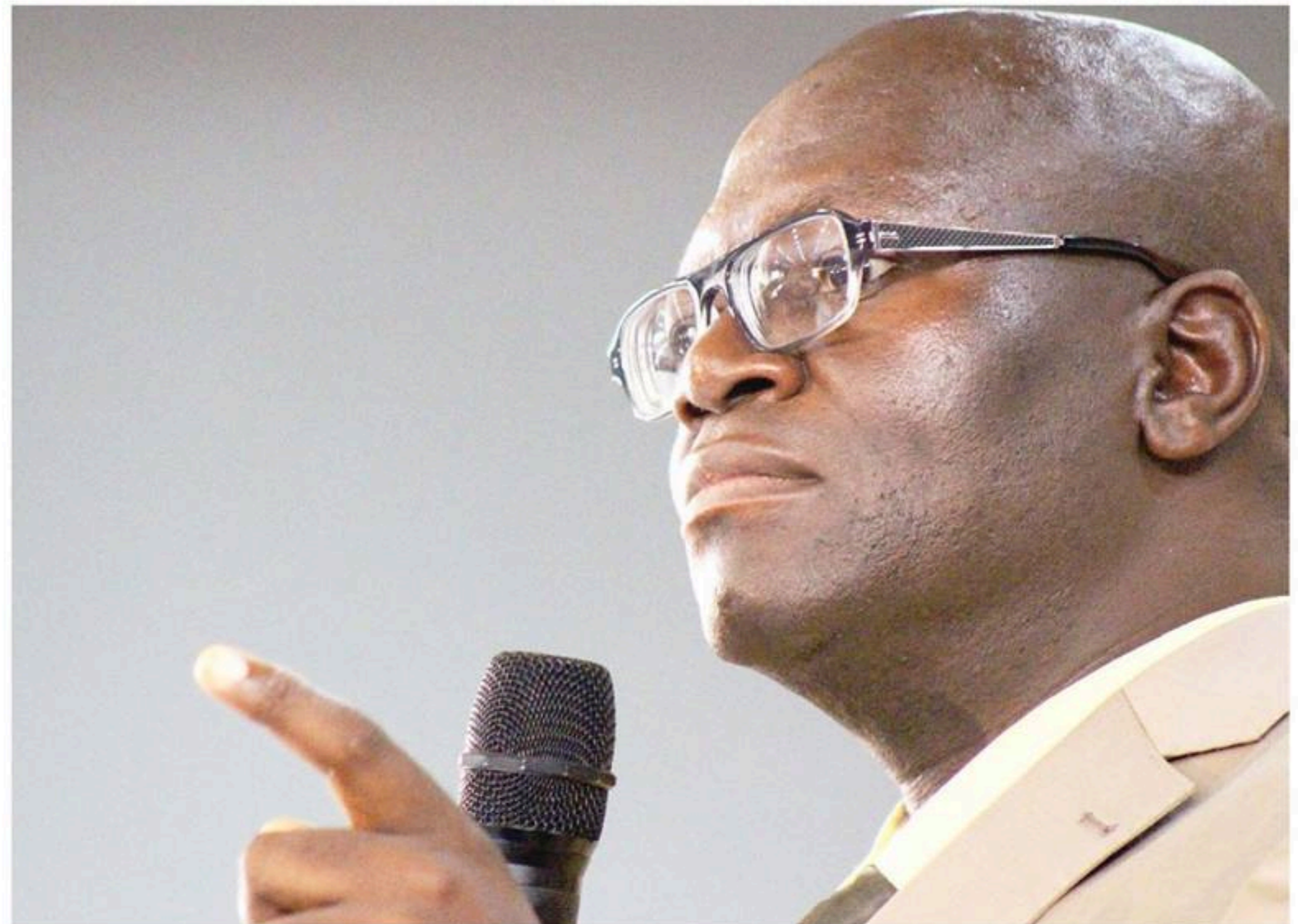
MEC for Education : Hon. Maaria Ishmael Kgetjepe